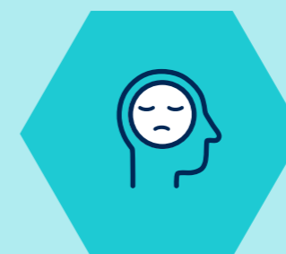
Awareness of Mental Health Problems