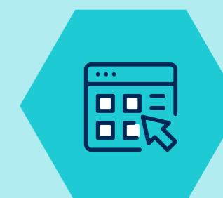
Lean Organisation Management Techniques